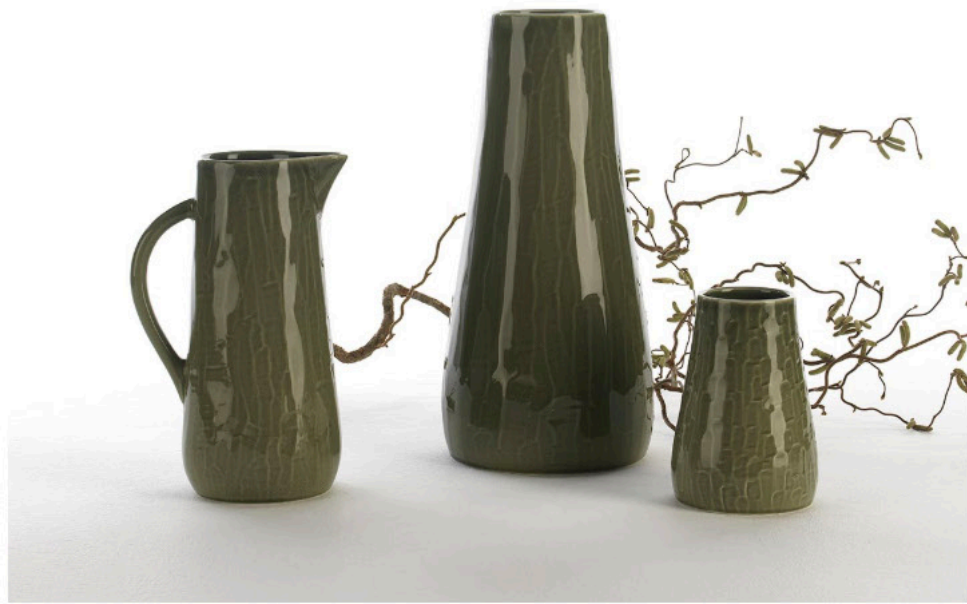
Garden | Dry green glossy glaze