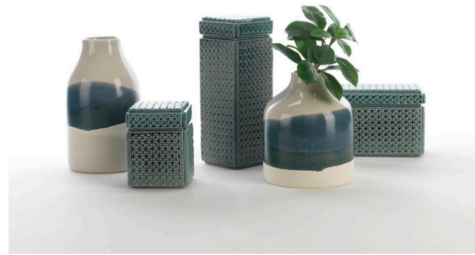
Baco & Lace Boxes | Various techniques