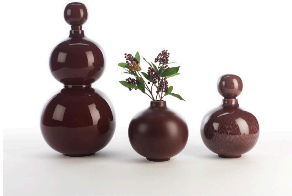
Opulence | Glossy and matte