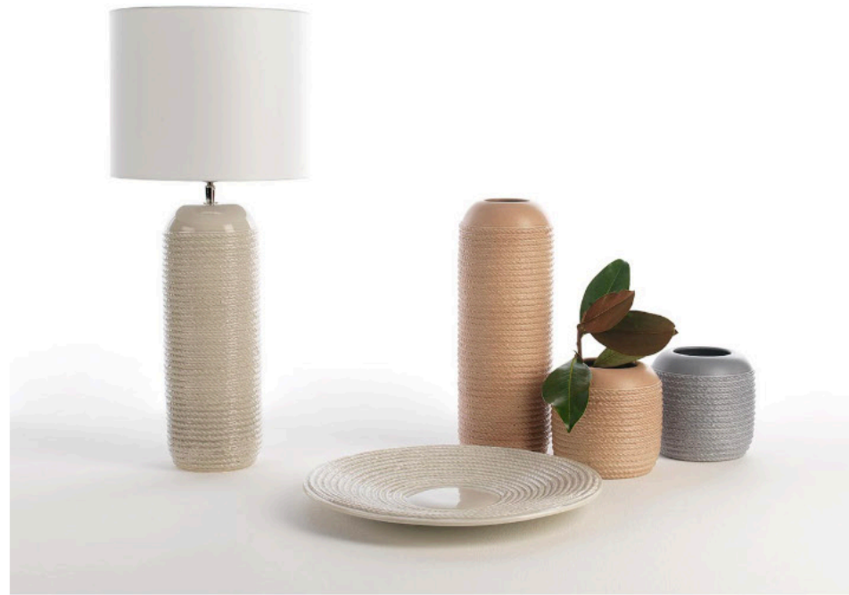
Rope | Regular glazes