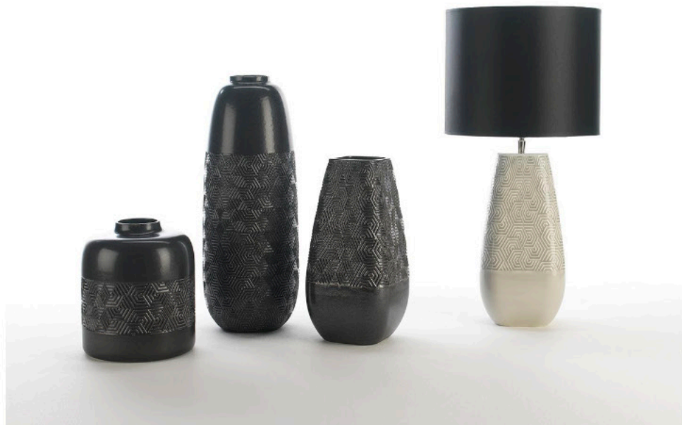
Evolution | Reactive glazes