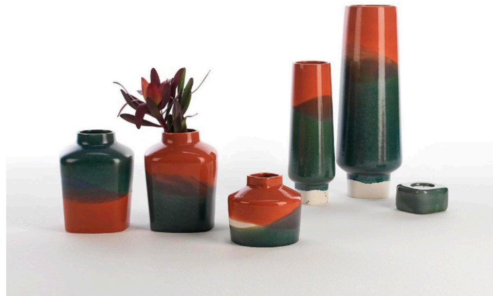
Retro | Layer-on-layer dip