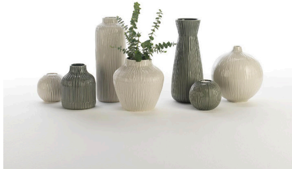
Alpes | Regular translucent glaze