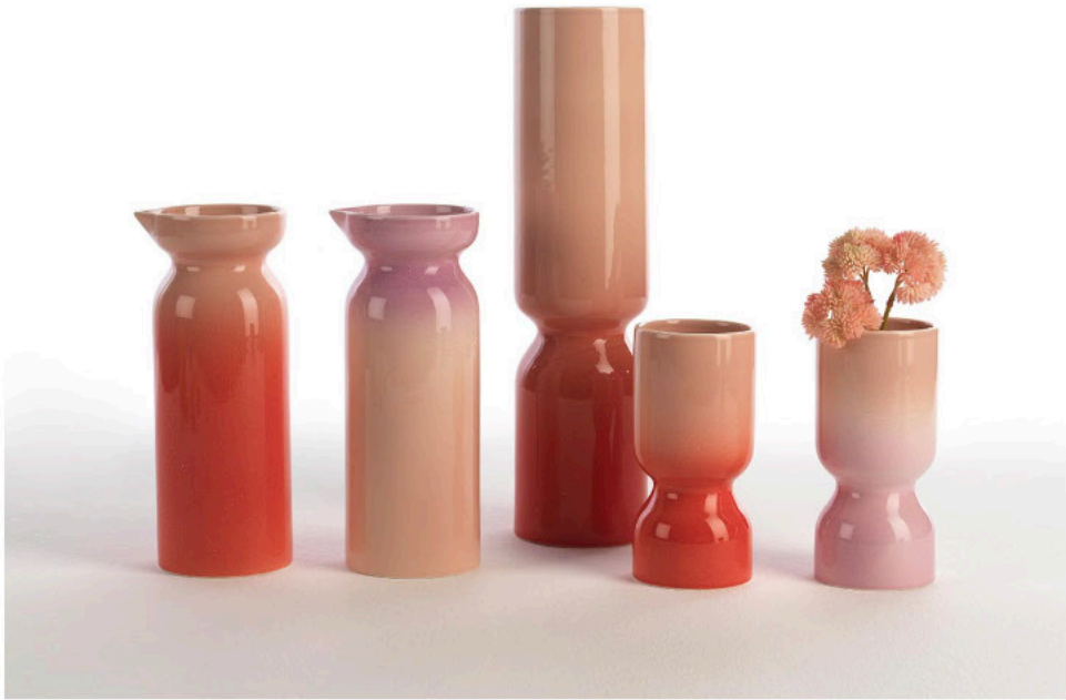
Time | Gradient effect