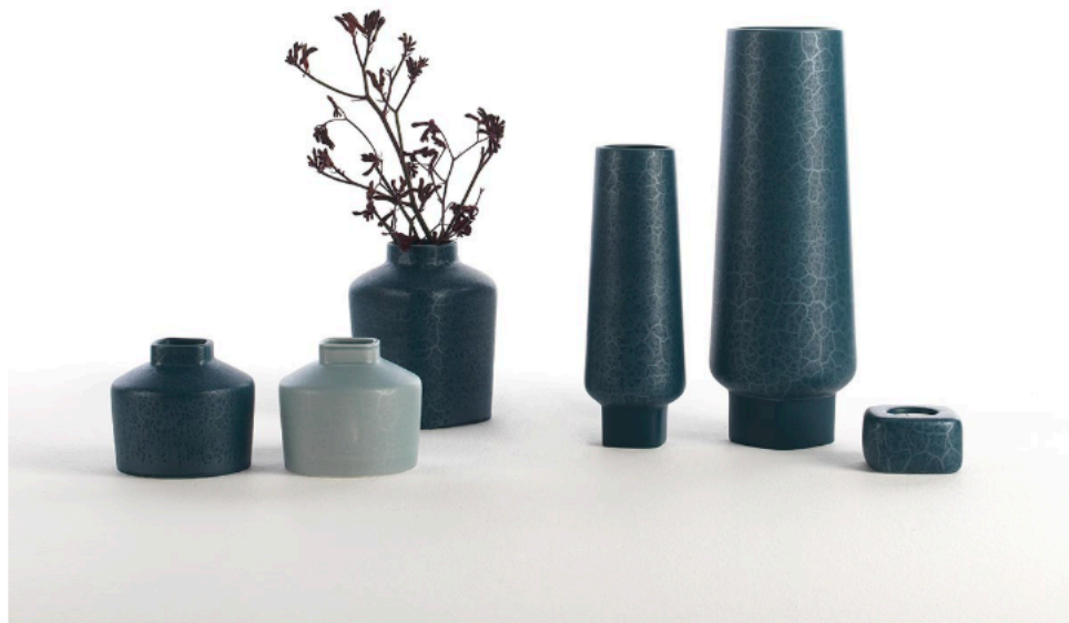
Retro | Marmoreal luster on matte base