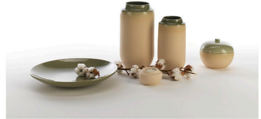
Alpha | Slip glaze with glossy dip on top