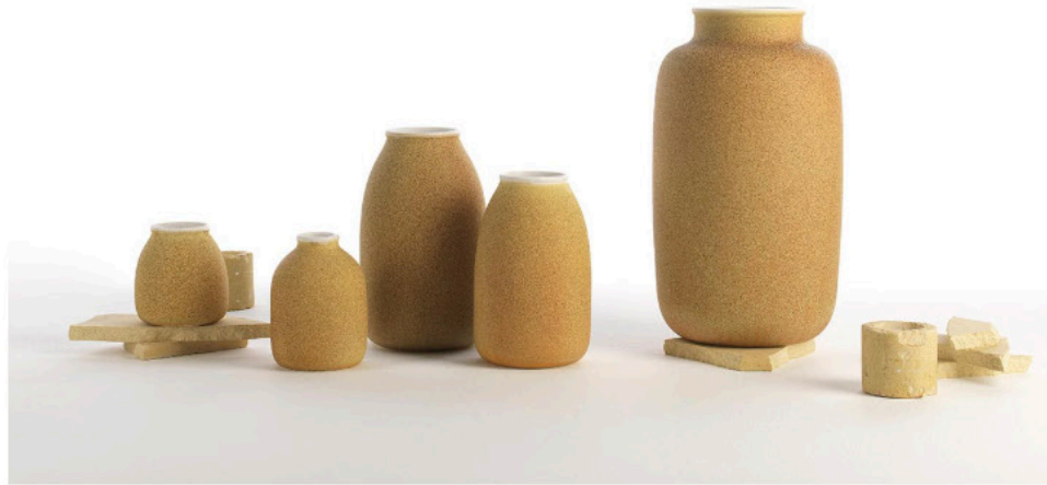
Eclectic | Mustard cork-like effect glaze