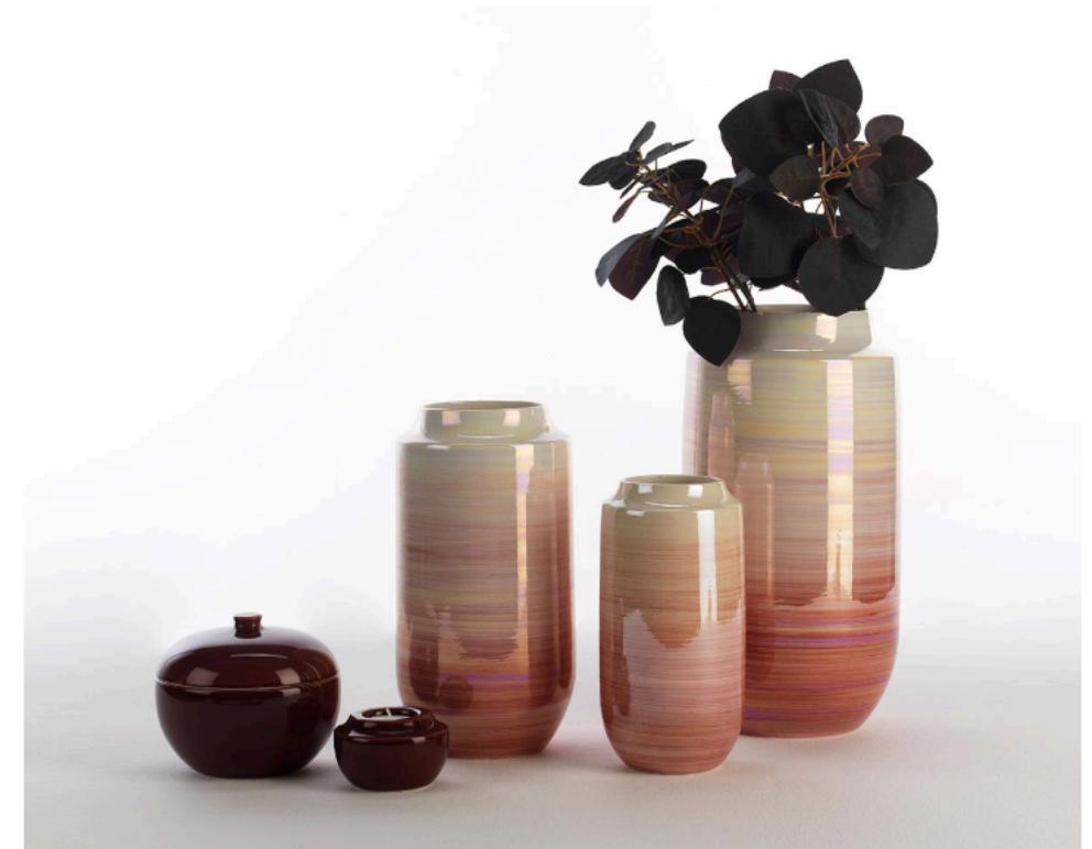
Alpha | Hand painting with luster finishing