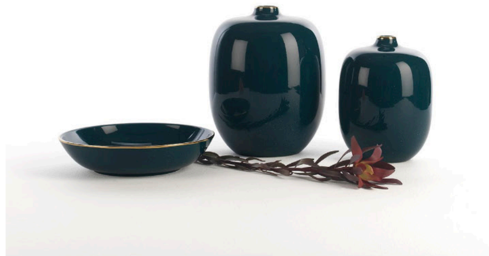
Vintage | Golden accent hand painted