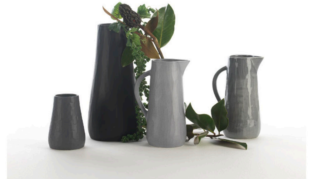
Garden | Charcoal color scheme