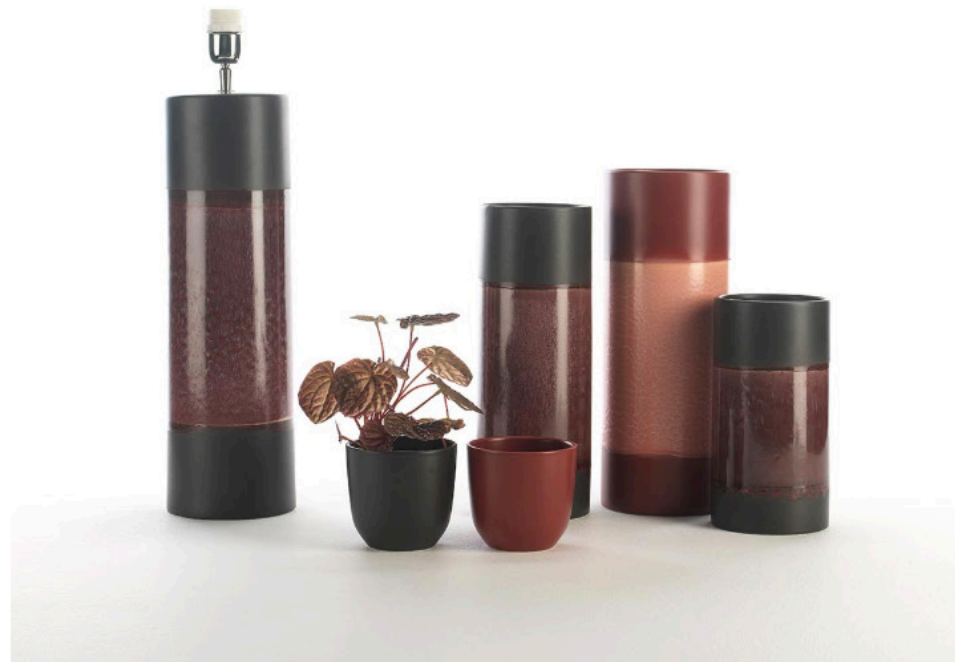
Plain | Tubular Vases in reactive finishing