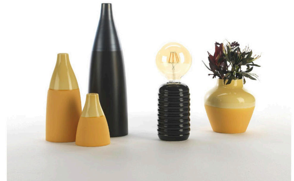
Piana & Double Lamp | Dual dip technique