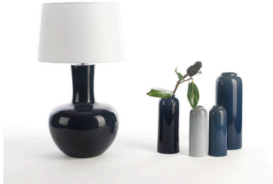
Kenya & Wish Lamp | Granite-like effect