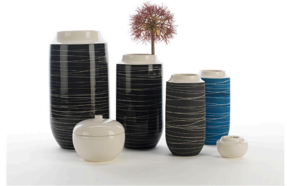
Alpha | Line effect