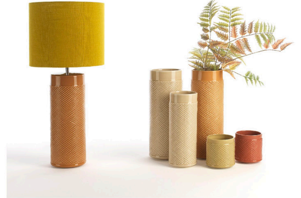
Refresh | Glossy ochre color scheme