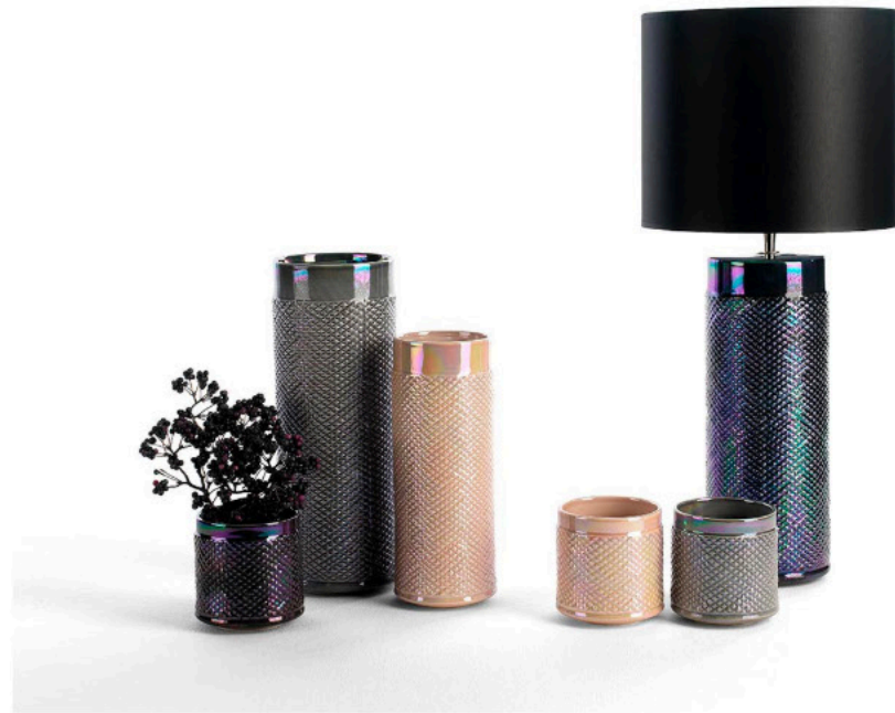
Refresh | Iridescent finishing