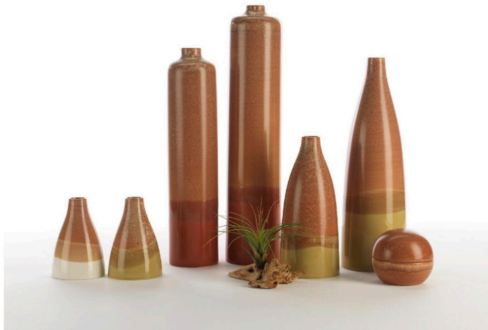
Piana & Makalu | Reactive glazes