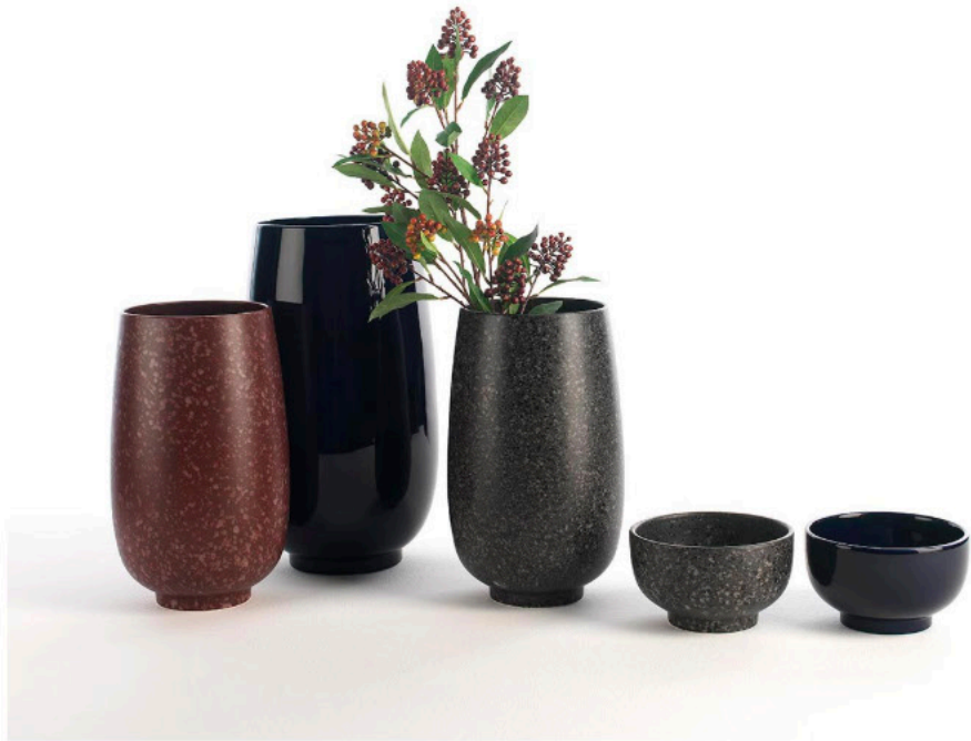
Heaven | Granite-like glaze