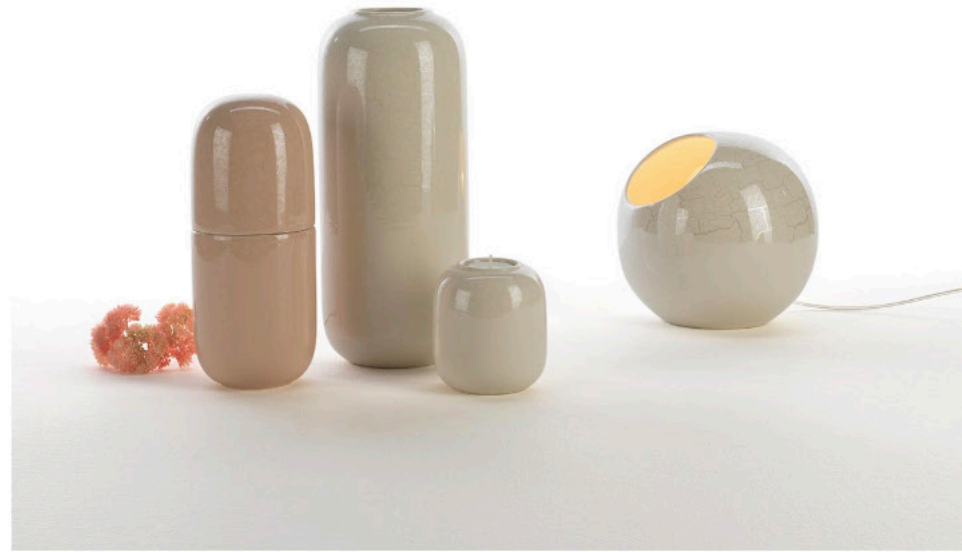
Capsule & Bubble Lamp | Marmoeal effect