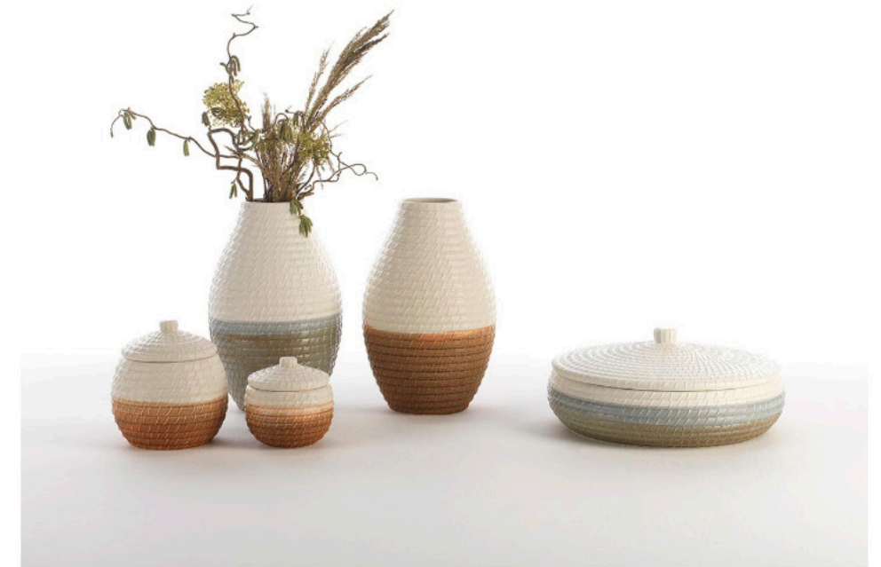
Morocco | Dual dip