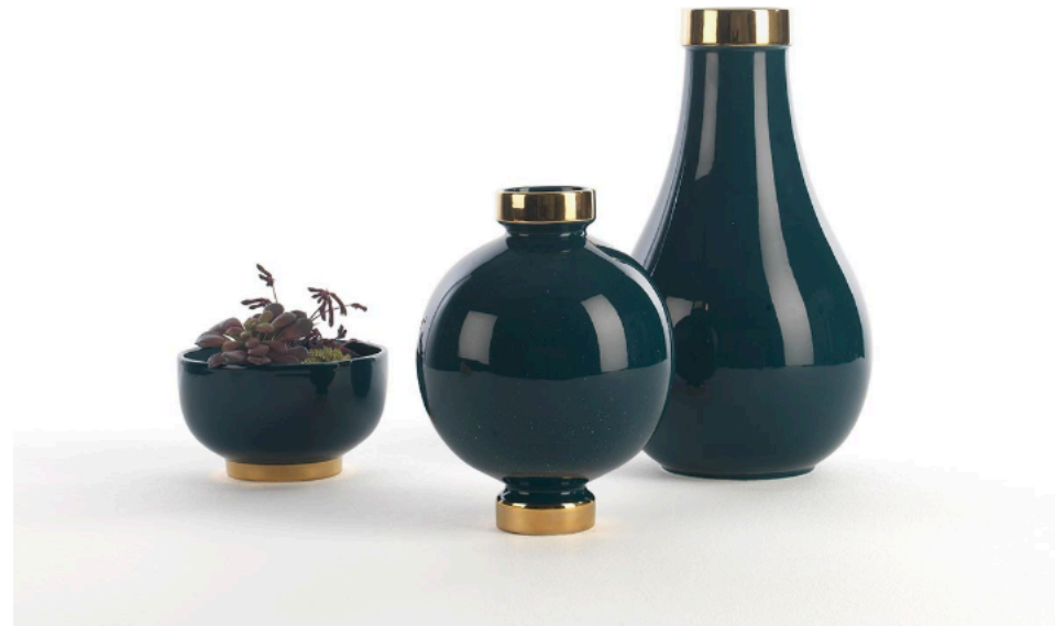
Opulence | Handpainted golden accent