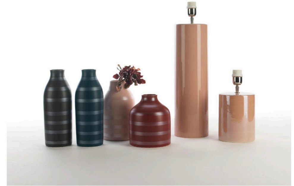
Baco & Plain Lamp | Various techniques