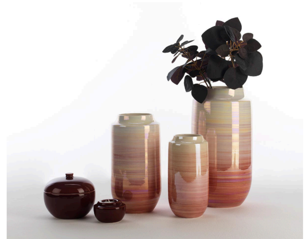
Alpha | Hand painting with luster finishing