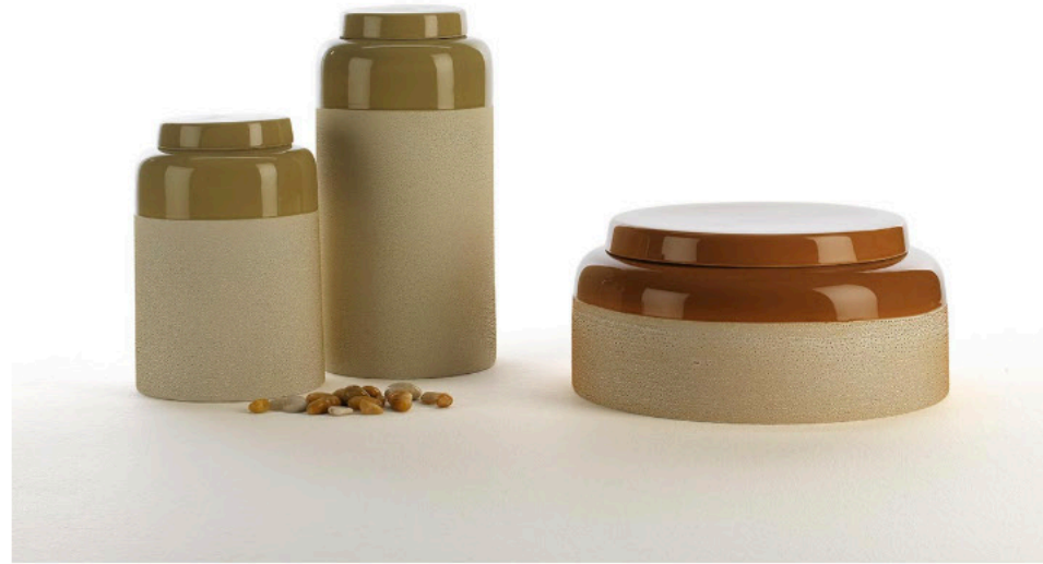
Makalu | Repellent effect glaze