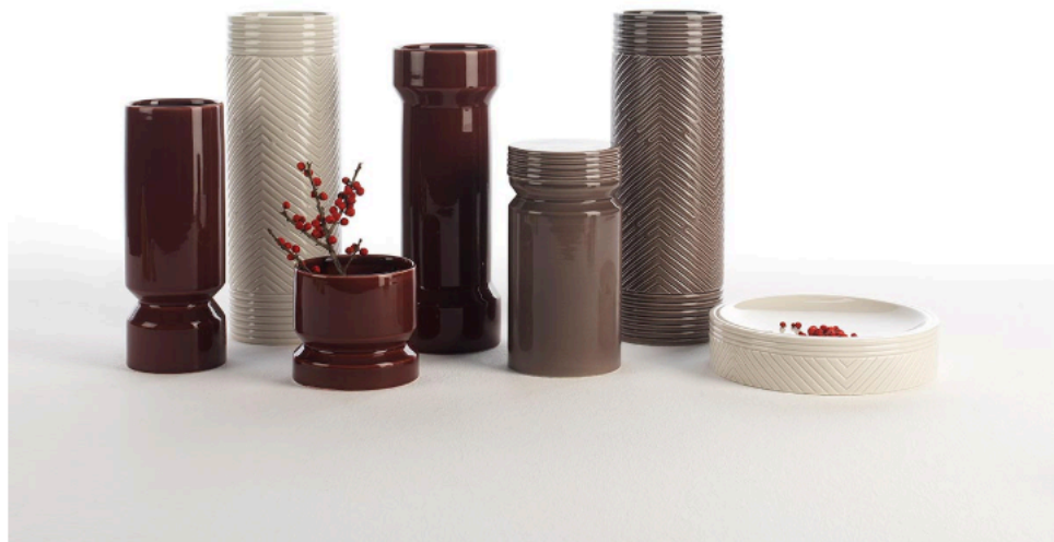
Profile | Glossy finishing