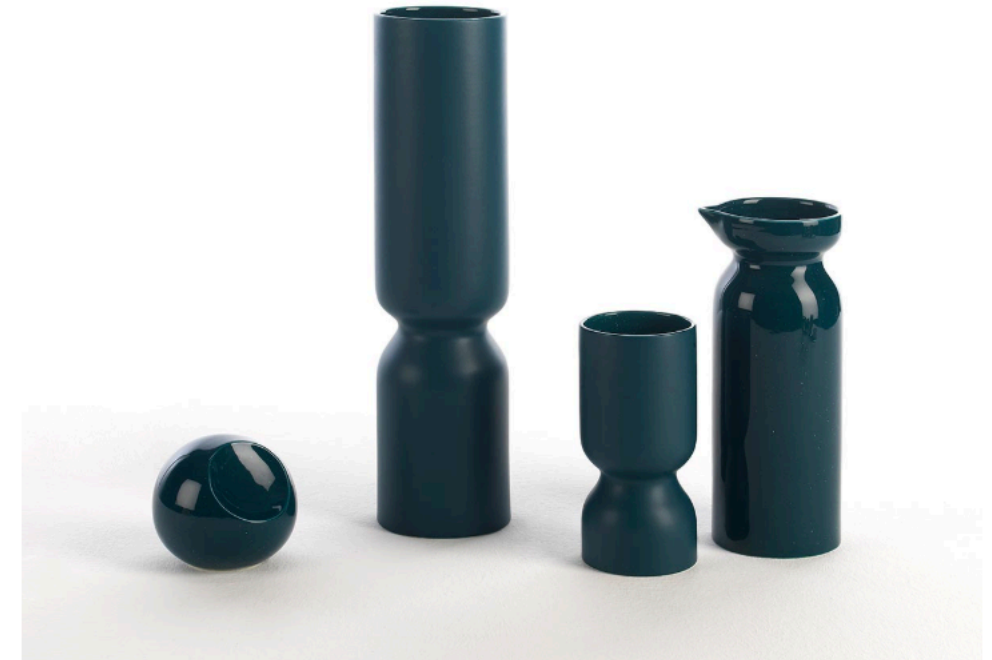
Time | Glossy and matte