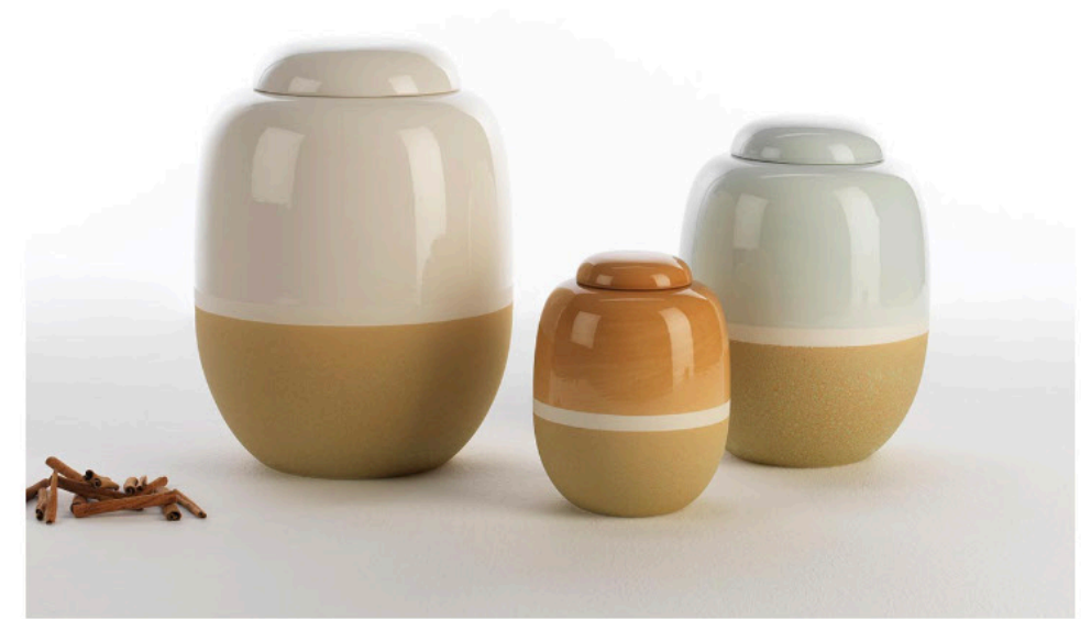
Vintage Pot | Slip base with glossy top