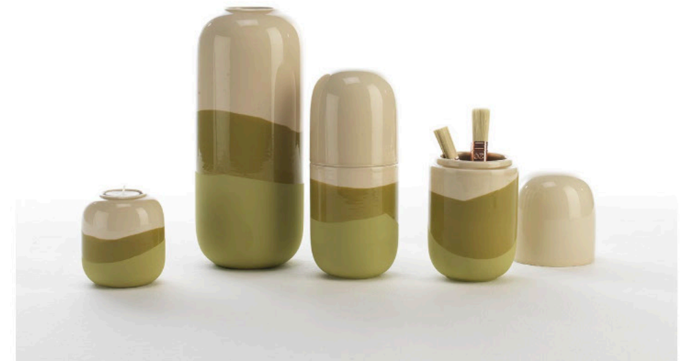
Capsule | Multi-dip technique with slip base