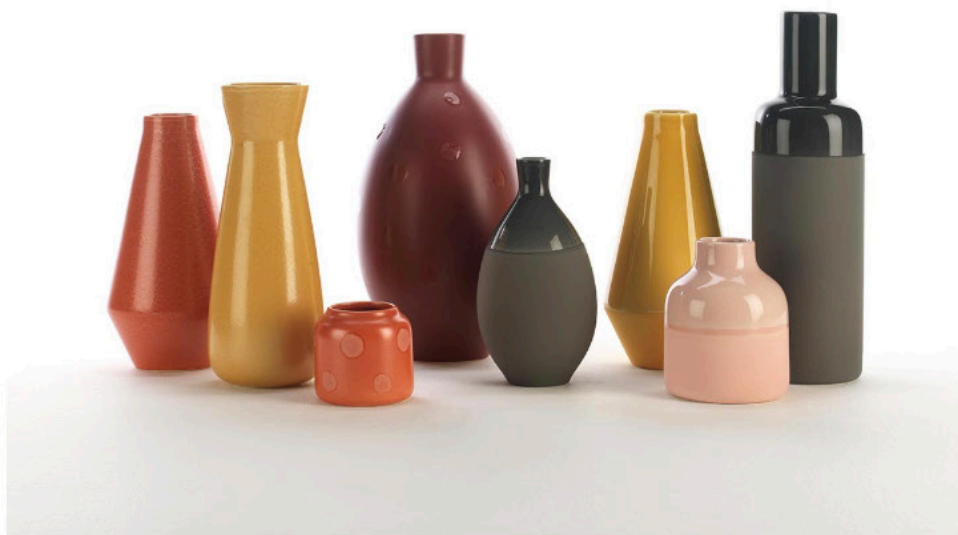
Family | Various techniques