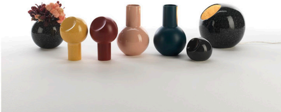
Bubble | Various techniques