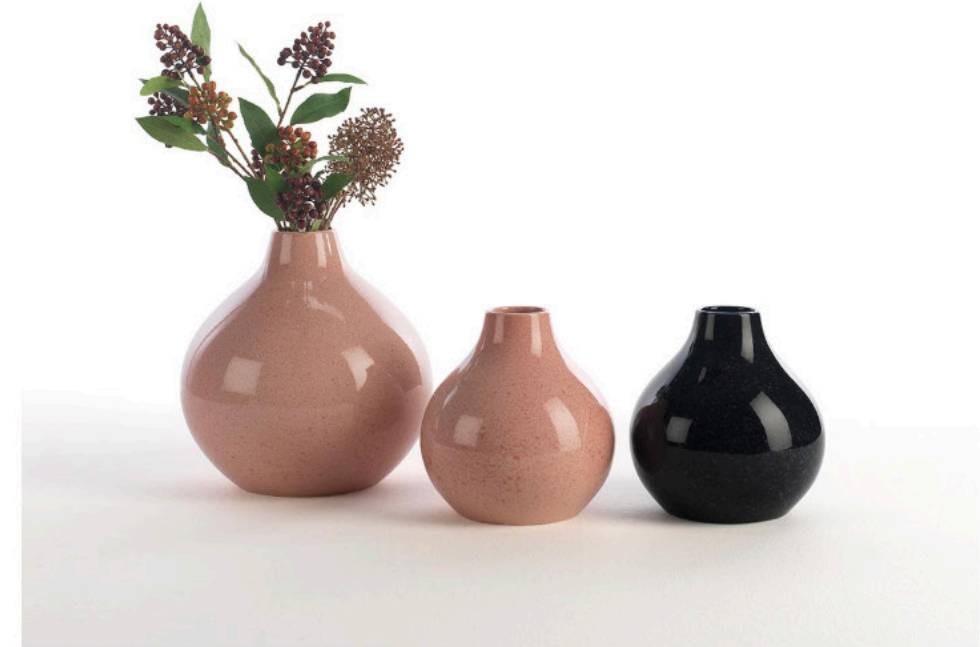
Sidney | Granite-like effect