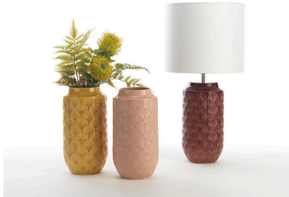
Lalique | Fish scale pattern