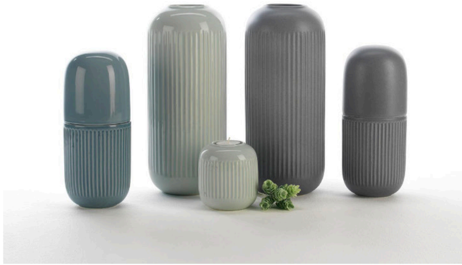
Capsule | With relief